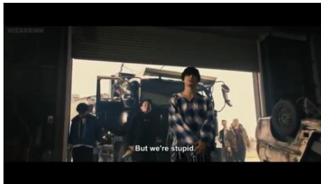
Figure 11 fighting as a masculine act for men