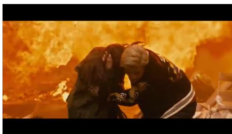
Figure 9 a masculine man is a male figure who protects weaker people