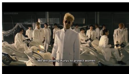
Figure 7 the attitude of a masculine male figure