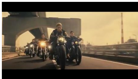
Figure 3 man riding a big motorcycle