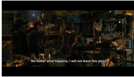
Figure 10 hobbies and motives for masculine men's clothing