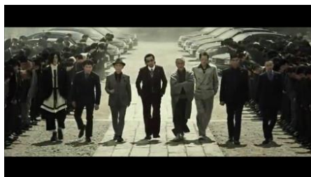
Figure 4 masculine male style