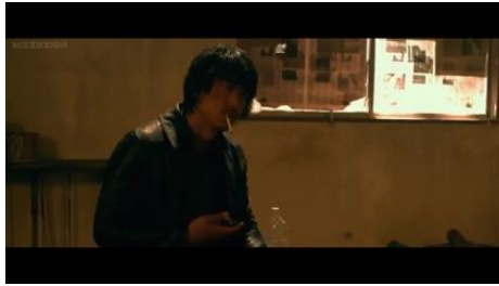
Figure 5 the figure of a man who smokes in the view of masculinity