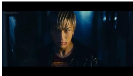
Figure 6 masculine male figure expression