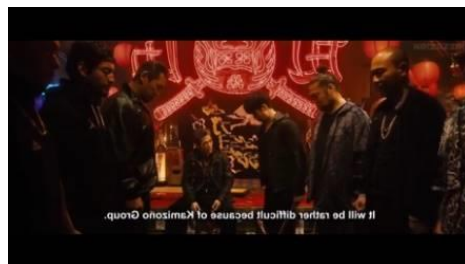
Figure 2 body language and masculine colors