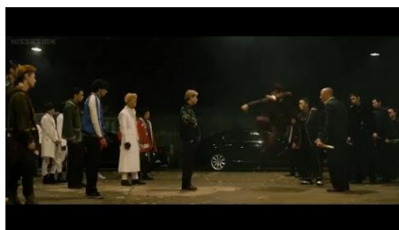
Figure 12 identity clothing and gang fights in movies