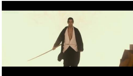
Figure 8 samurai as a reference for masculinity in Japan in his time