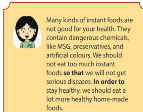
Figure 4 Efforts to maintain personal and environmental health and hygiene

personal hygiene, home environment and healthy food. Students are asked to give opinions on how and what they should do to maintain their health to avoid getting sick.