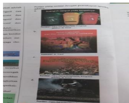
Figure 3 To maintain cleanliness and the natural environment

In the 8th grade Indonesian textbook, Unit 2, the theme is 'Creative ideas in advertisements, posters and slogans'. Sub-theme 'Making advertisements, posters and slogans'. At first glance, the theme and sub-theme do not contain the value of cleanliness, but in making slogans, advertisements and posters there are calls to care for the environment. Like some examples of the following pictures.